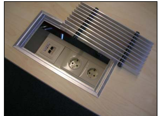
Table Power and Ethernet Acces