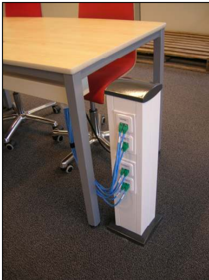
Table Ethernet Access Point