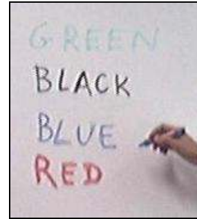
Large Pen width