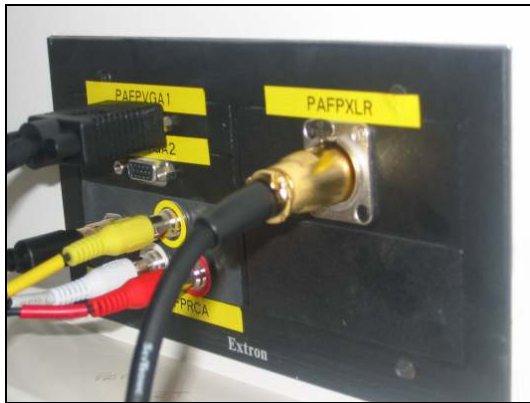
VGA, SVideo, Composite and XLR interfaces