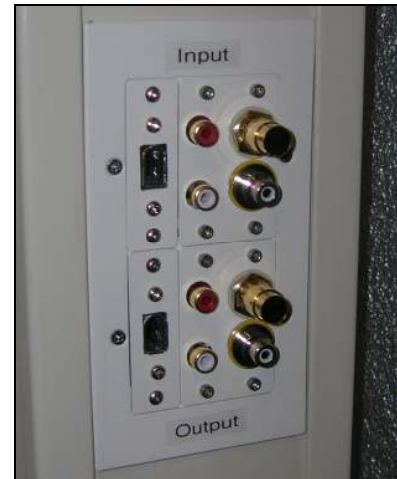
Composite and SVideo