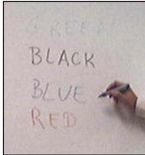
Normal pen width

When using white boards it should be used large dark pens / chalks widths to improve perception as you can see in both figures below.