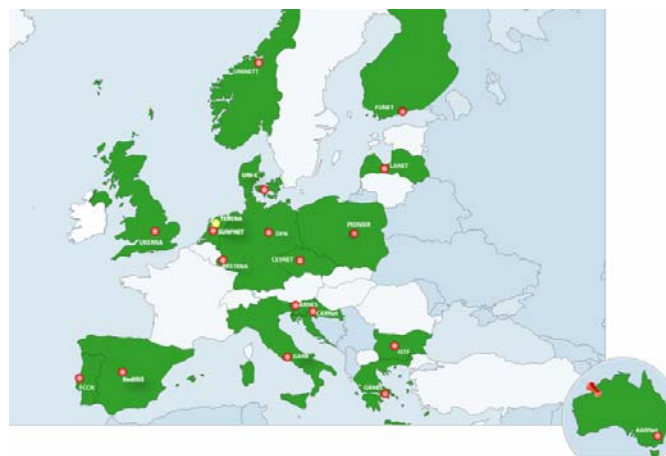
Figure 3: Current Eduroam Participants

Because the user credentials travel via a number of intermediate servers, not under control by the home-institution of the user, it is important that the credentials are protected for privacy reasons. This requirement limits the types of authentication methods that can be used. Basically there are two categories of useful authentication methods, those that use credentials in the form of some public key mechanism with certificates (EAP-TLS, EAP-SIM) or those that use the so-called tunneled authentication (EAP-TTLS, PEAP). Authentication using both server and end-user certificates requires the roll-out of a public key infrastructure (PKI) with end-user certificates which has proven difficult in most NRENs. Most institutions therefore use a tunneled authentication method that only requires server-certificates.